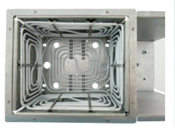
(3D FEA Modeled Photovoltaic Heater)

a result of our metrology and failure analysis, the heater element sheath material was changed to a high grade alloy with a special oxide coating applied to the heater wall to help withstand the chemical environment. In combination, Durex' heater design improvements dramatically extended heater life and reduced costly maintenance.