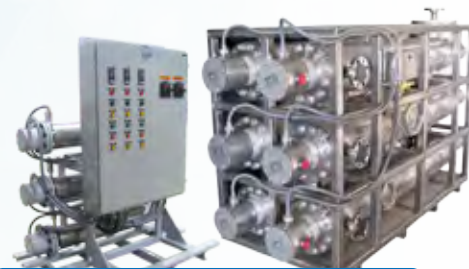
Process Heating Systems