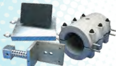
Cast In Heaters