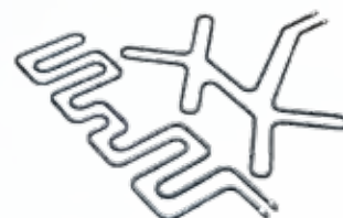
Tubular Heating Elements