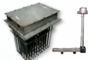
Duct Air & Tank Heaters