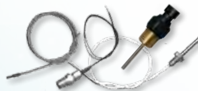
Precision RTDs & Thermistors