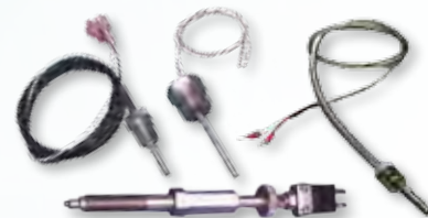
Plastic & Food Industry Sensors