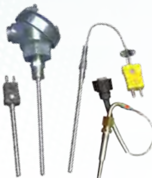
High Performance MI Thermocouples & RTDs