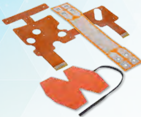
Silicone & Kapton Flexible Heaters