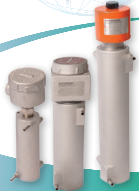
DFX™ Heat Exchangers

For more information, visit our website! www.durexindustries.com